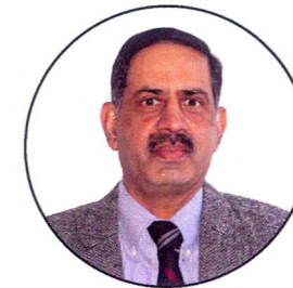
Prof. (Dr.) Balram Bhargava Padmashri Secretary, to Govt. of India, DHR, M/O Health and Family Welfare & Director General ICMR

Antimicrobial Resistance (AMR) is a potential threat to humankind. As a part of National Action Plan for containment of AMR in India, ICMR-AMR Surveillance Network has been established. This particular endeavor of ICMR has been carried forward by creation of the National Repository of Antimicrobial Resistant Bacteria (NRAMRB) and AMR Hub at ICMR-NICED. The NRAMRB facility, with highly characterized AMR strains will provide an immensely useful platform for other researchers in India for their future research activities on containment of AMR. In addition, therapeutic failure of antibiotics has also powered the discussion on potential alternatives for treatment of bacterial infections. "Phage Therapy" being one of them, has opened up the opportunity for development of a proper research model to explore its' therapeutic attributes. This upcoming seminar at ICMR-NICED aims to create a better understanding of these interconnected areas. Under the mentorship of Professor (Dr.) Balram Bhargava, the road map for containment of antimicrobial resistance at the national level has been developed by Indian Council of Medical Research (ICMR).