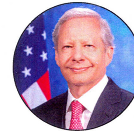
Mr. Kenneth I. Juster Honorable Ambassador of the United States US Embassy, India